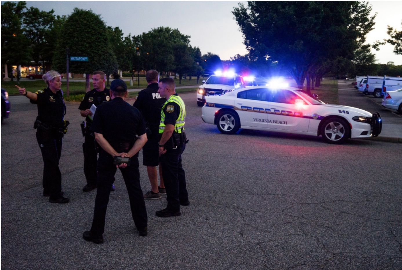
Police officers remained outside the Virginia Beach Municipal Center after a gunman killed 12 people there on Friday.